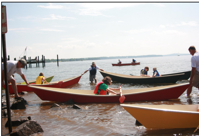
L to R: A choppy trip in the War Canoe • Teens showing off their handiwork The great colors of this year's canoes • The launch of the Teen Boats